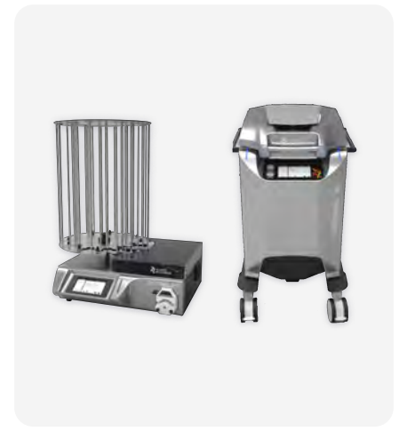
Media and Food Sample Preparation Systems