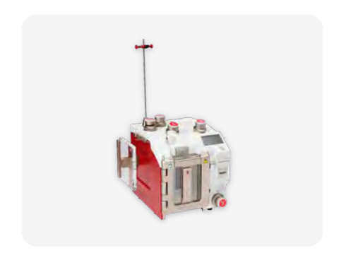
Automatic Blood Component Extractors