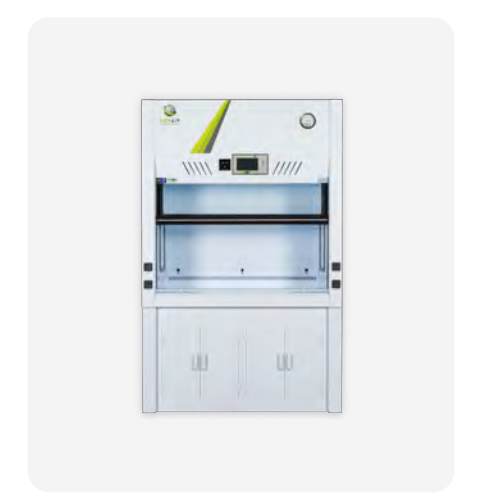
Fumehoods and PCR Workstations