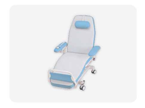
Blood Donation and Therapy Chairs