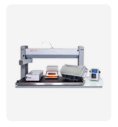
Automatic Bottles and Tubes Fillers