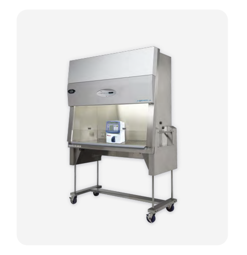
Biological Safety Cabinets