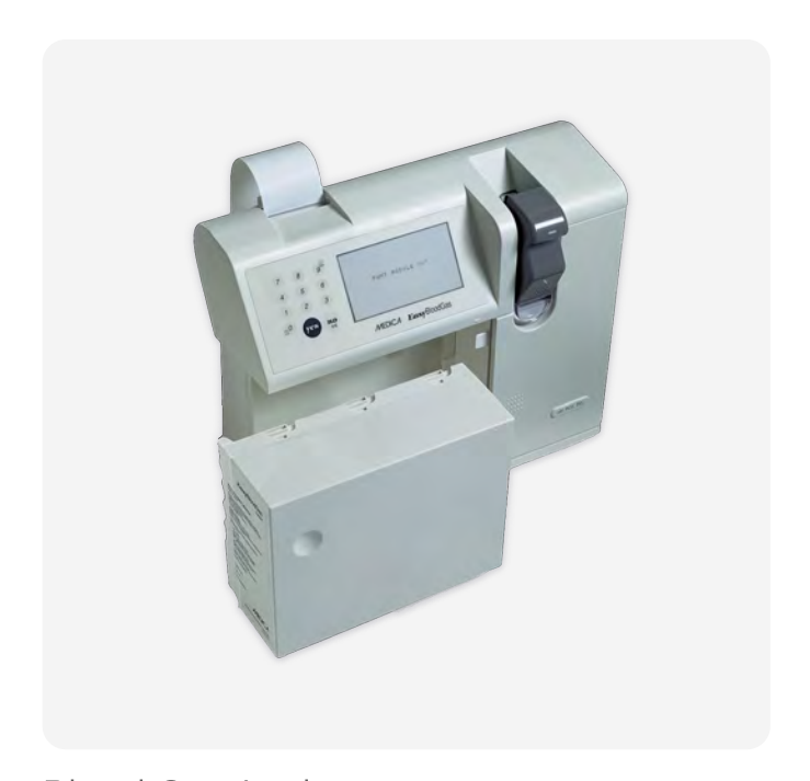
Blood Gas Analyzers