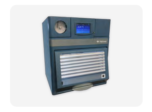
Platelet Storage Systems