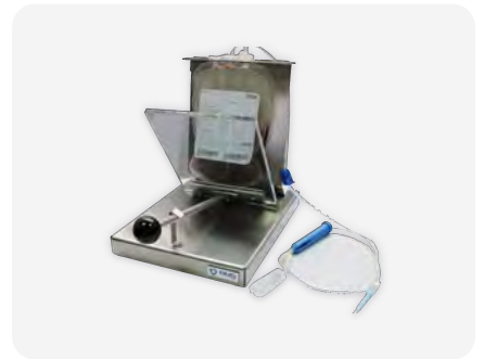
Mechanical Plasma Presses