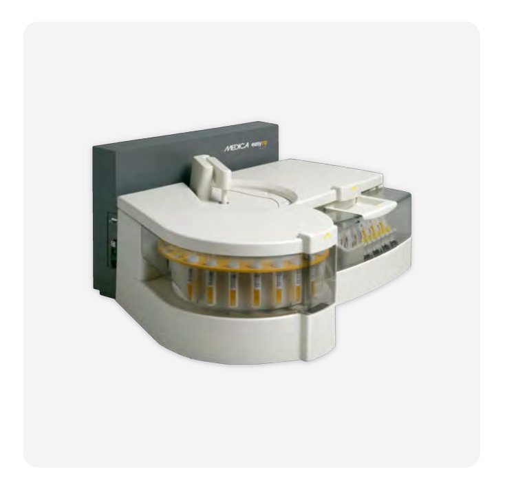
Clinical Chemistry Analyzers