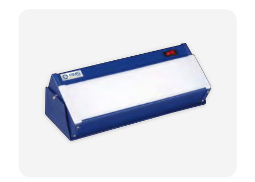
RH View Boxes