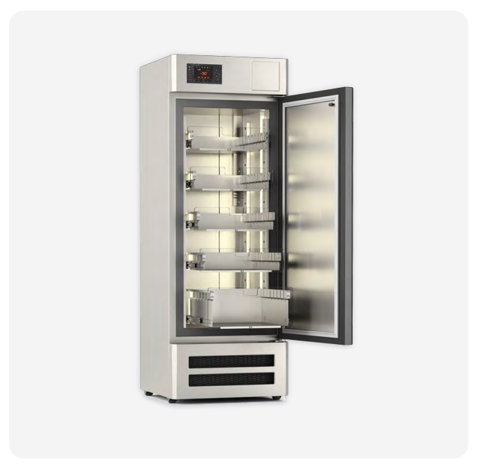
Laboratory and Pharmacy Refrigerators