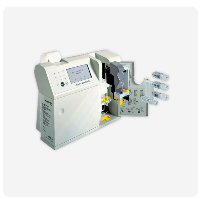
Electrolyte and Blood Gas Analyzers