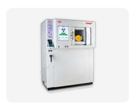
X-Ray Irridiation Systems