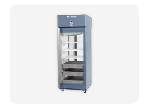
Blood Bank Refrigerators