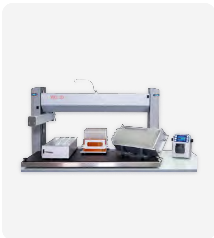
Automatic Bottles and Tubes Fillers