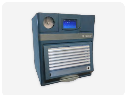
Platelet Storage Systems