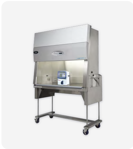
Biological Safety Cabinets