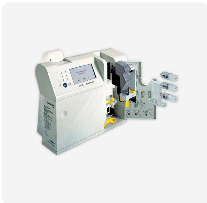
Electrolyte and Blood Gas Analyzers