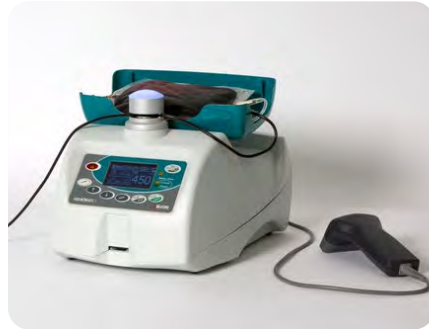
Blood Bag Mixers and Tube Sealers