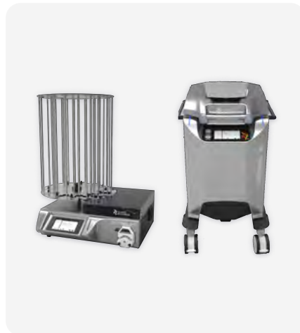
Media and Food Sample Preparation Systems