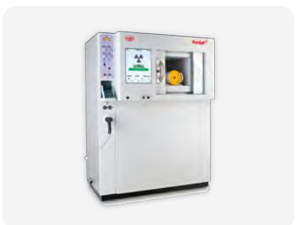
X-Ray Irridiation Systems