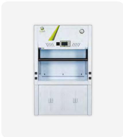
Fumehoods and PCR Workstations