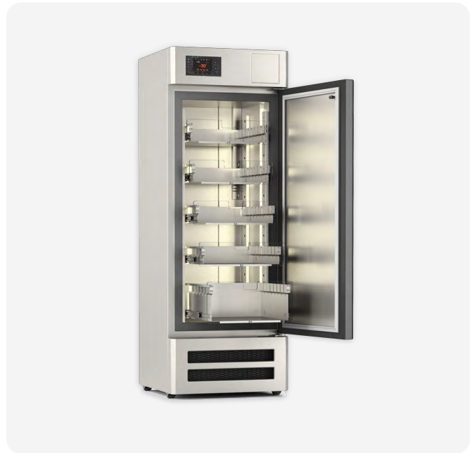
Laboratory and Pharmacy Refrigerators