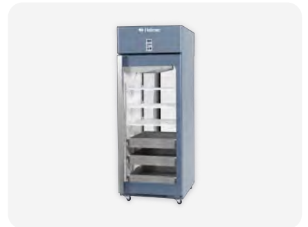
Blood Bank Refrigerators