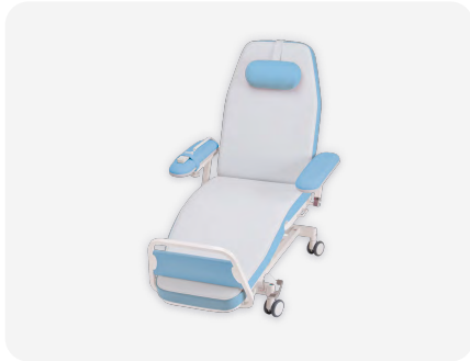
Blood Donation and Therapy Chairs