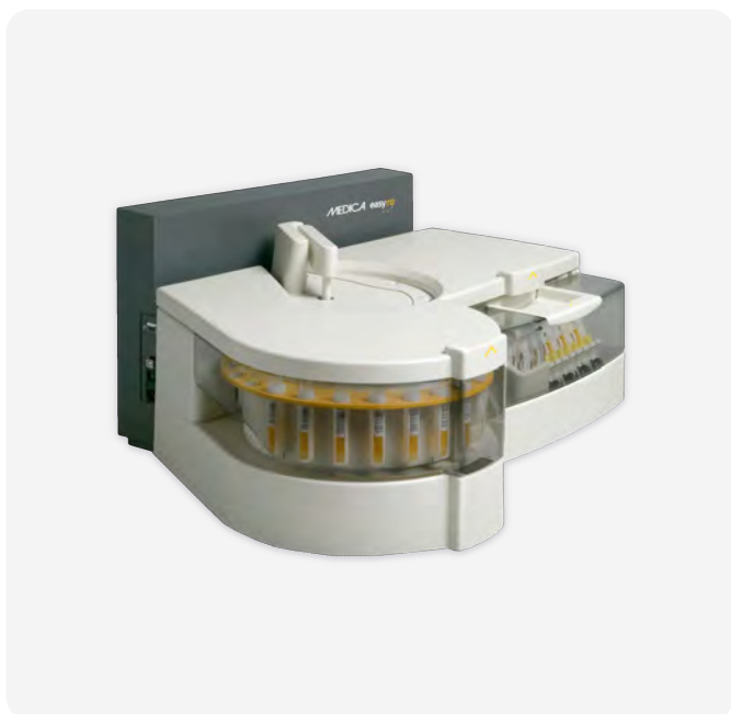
Clinical Chemistry Analyzers