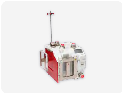
Automatic Blood Component Extractors