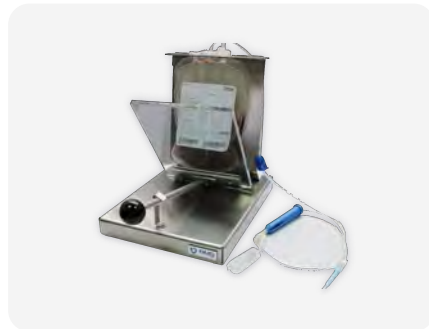
Mechanical Plasma Presses