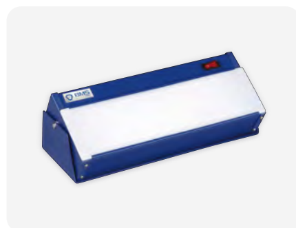
RH View Boxes