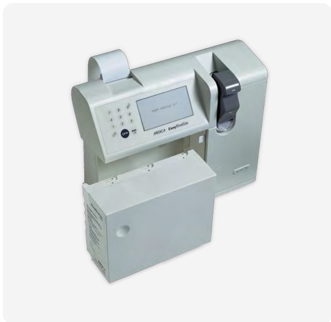
Blood Gas Analyzers